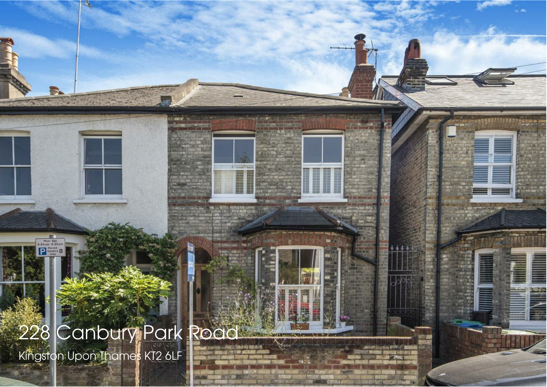
228 Canbury Park Road Kingston Upon Thames KT2 6LF